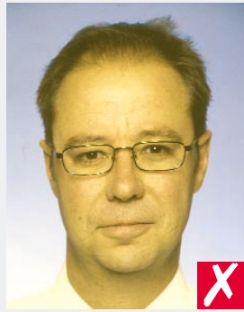
unnatural skin tones