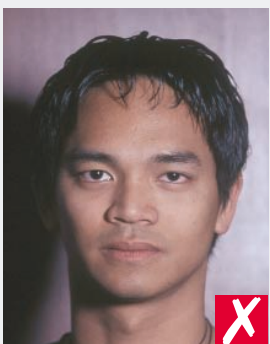
shadows behind head