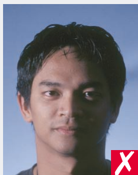
shadows across face